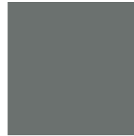
Bronze - BRZ